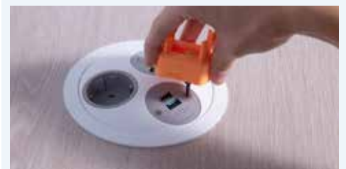
Using the TUF replacing tool and 'snake eye' bit, screw the snake eye screws back into place