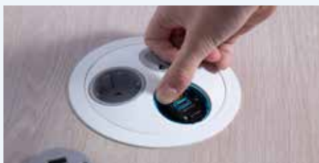
Push the cartridge into the blue housing until a click is heard.