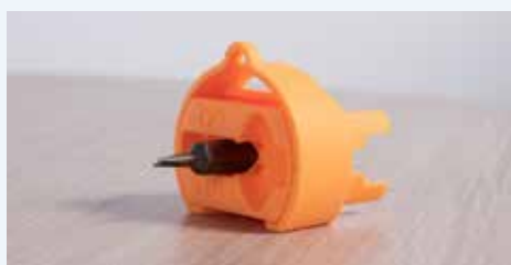
Insert the 'snake eye' bit into the tool as shown.