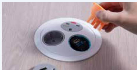
Insert the second part of the TUF replacing tool into the TUF as shown, until a click is heard.