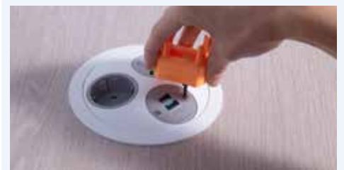
Use the tool to unscrew the 'snake eye' screws.