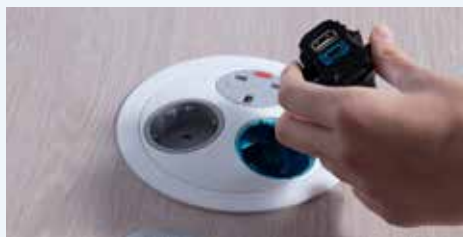
Unwrap and insert the new TUF cartridge, paying close attention to the orientation of the cartridge to the blue housing.