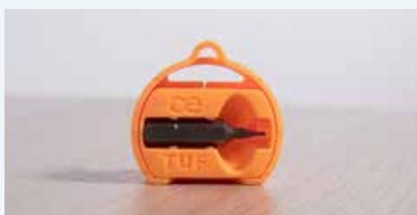
TUF replacing tool.