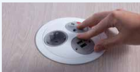
Place the TUF fascia back into position.