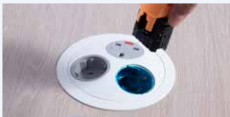
Pull the TUF cartridge out from the unit.