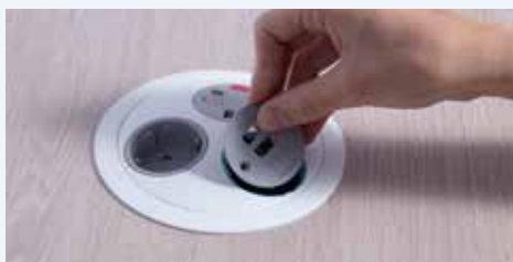
Lift off the TUF fascia